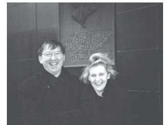
President and Secretary in Leipzig, at the spot marking Wagner’s birthplace.

The Glitterati on the forecourt of the theatre in Bayreuth. They’re hard to see, but the Kiwis are firmly in the centre!